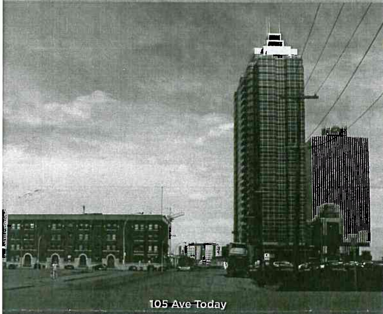
105 Ave Today