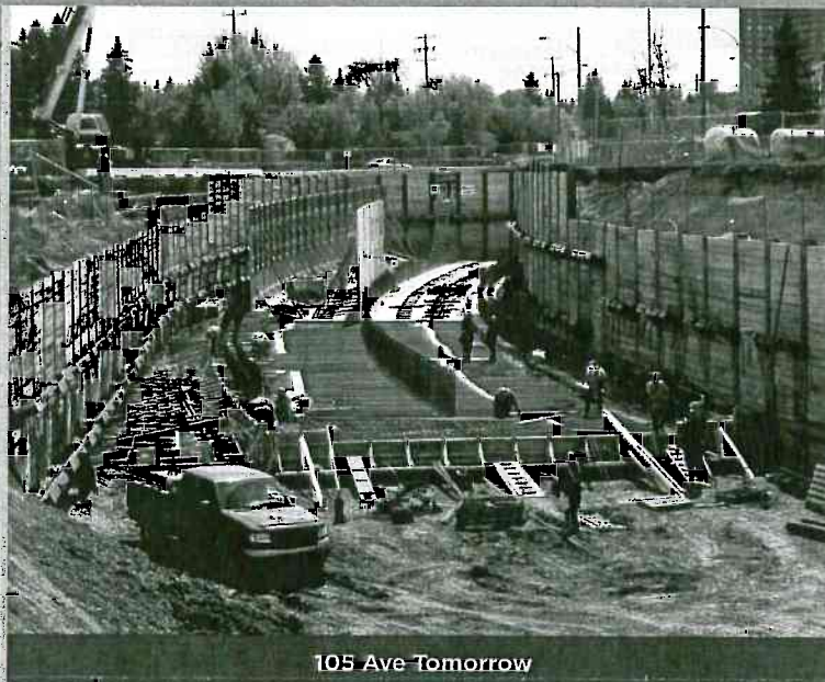
105 Ave Tomorrow

In July 2011, significant changes are about to begin on 105 Ave.