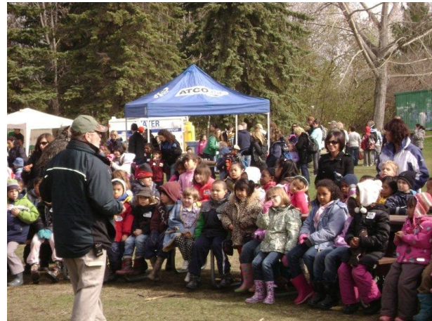
The Grade 1 children are fixated on the presenter from the Valley Zoo