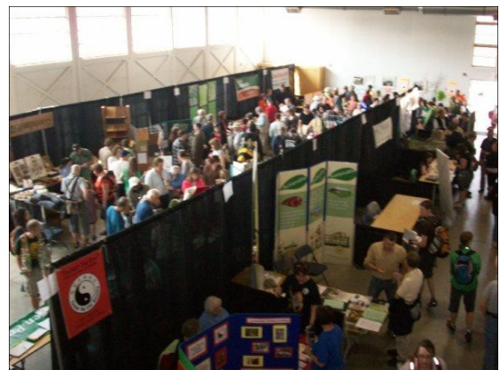
Earth Day Crowds & Exhibitors At Fort Edmonton Park